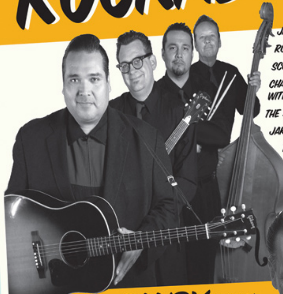
BIG SANDY (USA) AND HIS FLY-RITE BOYS

A SUNDAY NIGHT SPECTACULAR: THE '60 - '63 ELVIS NASHVILLE SESSIONS SHOW FEATURING THE SEVEN PIECE AUTHENTIC STYLE BACKING BAND - EXCLUSIVE - FIRST TIME SEEN IN THE UK!!!